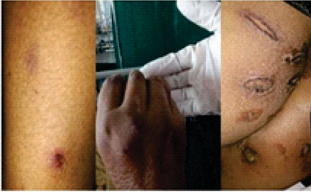
Figure 2: Erosions and ulcer at vaginal mucosa