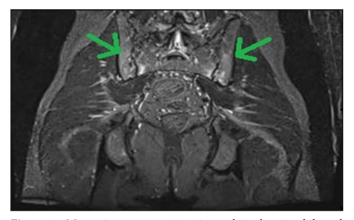
Figure 1: Magnetic resonance imaging pelvis showing bilateral sacroiliitis (green arrows).

The occurrence of cardiac symptoms in AS is widely documented, with the most prevalent being cardiac